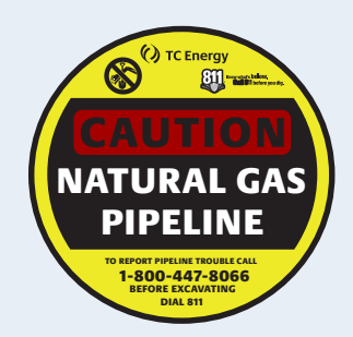
MARKER "BULLET" POST